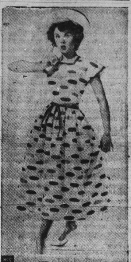
This pretty little miss is coy as can be in her fresh cotton pique frock splashed with vivid polka dots. Created by Lil' Alice, the cotton dress is designed to keep the young lady cool and collected in any summer situation.