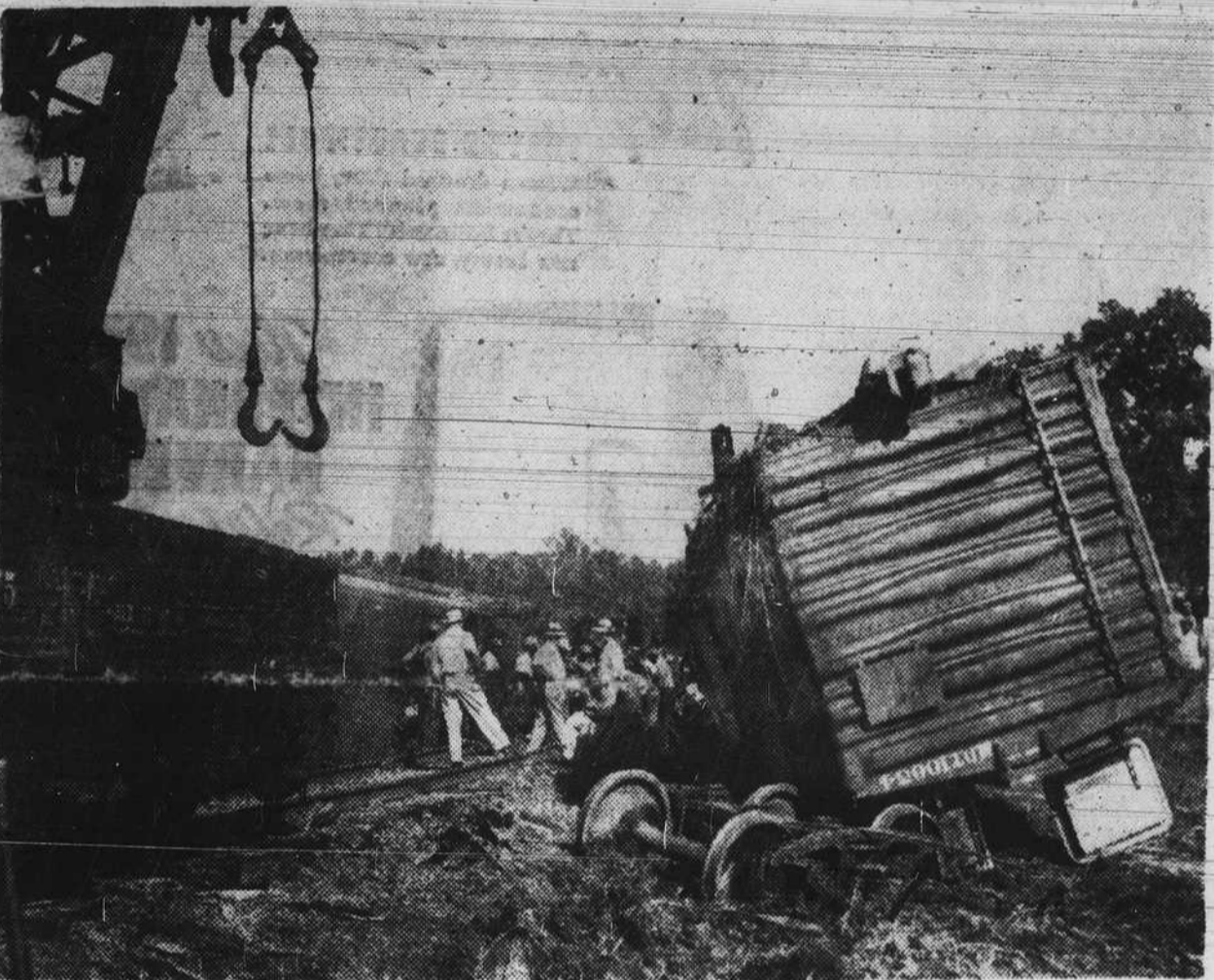
An insecurely-tied pulpwood log fell from a Southern Railroad boxcar Monday night just East of Hillsboro behind the home of Mr. and Mrs. Paul Collins and derailed eight cars with the result as shown above. According to railroad officials, the wood apparently fell between the metal wheels and the wooden cross ties, causing the cars to leap the track, crash into one another and overturn across the tracks or partially embed into the soft mud surrounding the tracks. All of the crew escaped uninjured. The accident occurred about 11:30, Monday night. The wrecked cars were pushed off the tracks by 9:30, Tuesday morning and full service had been resumed by 6 o'clock in the afternoon, with both Southern and Seaboard wrecking crews assisting in the work. A large number of local people made up the crowd of interested onlookers who watched the salvage operation.