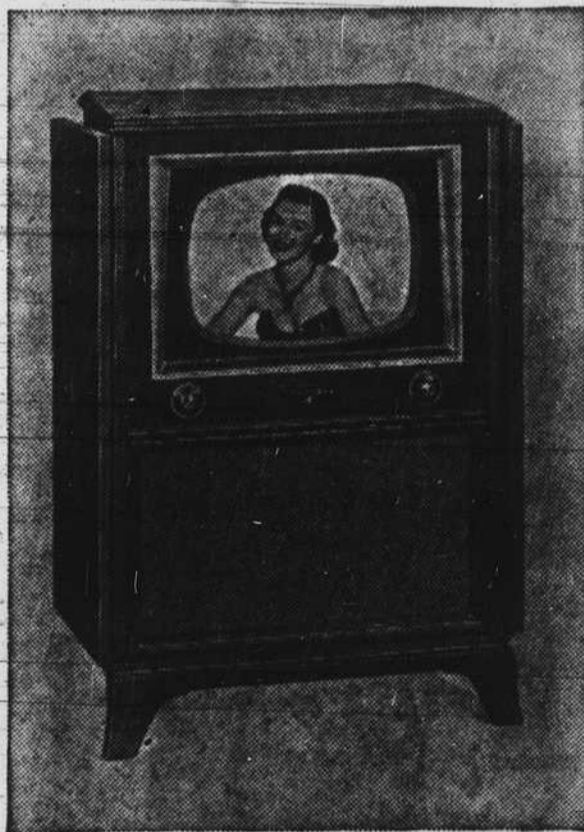
SYLVANIA 17" Mahogany DeLuxe Console, with doors. Big Mellow-Tone screen that gives you everything. Wonderful wide-angle, non-glare viewing. Studio-Clear sound. Built-in antenna. Only two front control positions. Provides for phonograph attachment. Also available in Walnut.