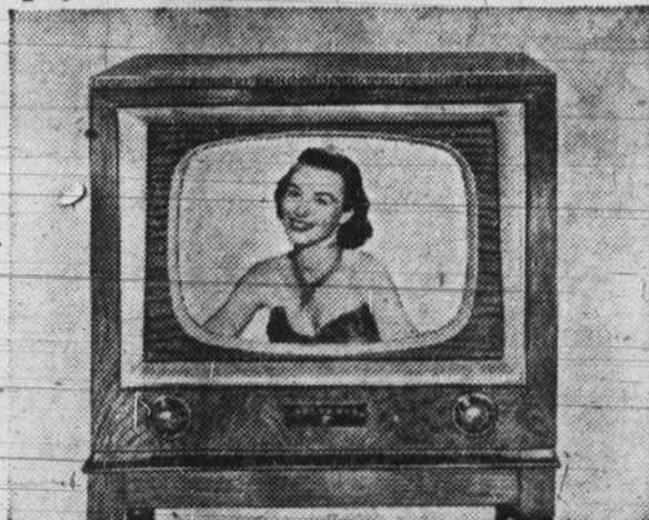
SYLVANIA 17" Table Model. Super-powered chassis. Movie-Clear pictures. Studio-Clear sound, static-free. Exclusive wide-angle, non-glare features. Built-in tunable antenna. Provides for phonograph attachment. Choice of three cabinets: Blond, Mahogany, Walnut—all Sundberg-Ferar styled!