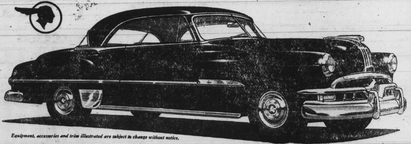
Equipment, accessories and trim illustrated are subject to change without notice.

What a Wonderful Story the Price Tag Tells!