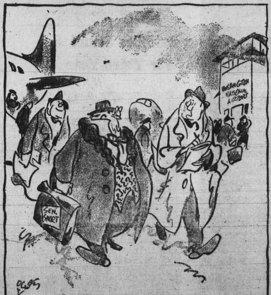
"After a quick swing around the Nation, I find the paramount issue before the country today is: 'How much are the monthly payments?'"