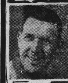
Under Personal Direction of Bill France Famous President of National Association of Stock Car Automobile Racing

ALL LATE MODEL STOCK CARS AMERICA'S TOP DRIVERS