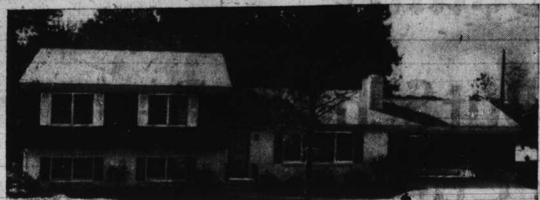
Plan No. A170 1511 Square feet Designed by Summer, Prater, White & Associates 732 W. Peachtree St., N.W., Atlanta, 3, Ga.