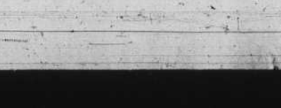
CHARLES F. FLOYD

"By helping with this census, you will help us assure your children adequate schools. We appreciate your help very much.