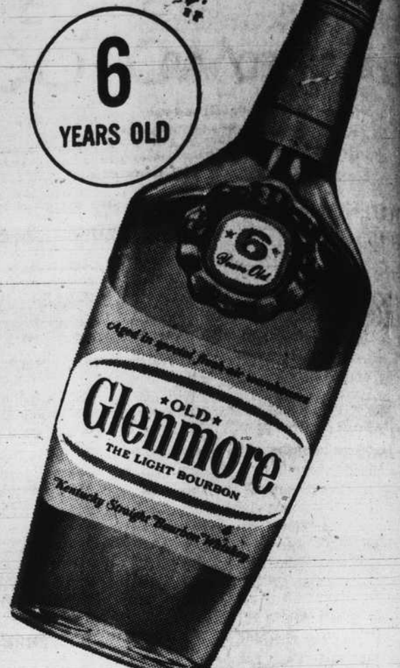
6 YEARS OLD

KENTUCKY STRAIGHT BOURBON WHISKEY • 86 PROOF