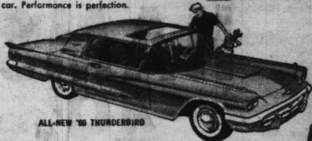
ALL-NEW '60 THUNDERBIRD

The fabulous Thunderbird, the world's most wanted car is finer than ever. Every detail says it's the ultimate luxury car. Performance is perfection.