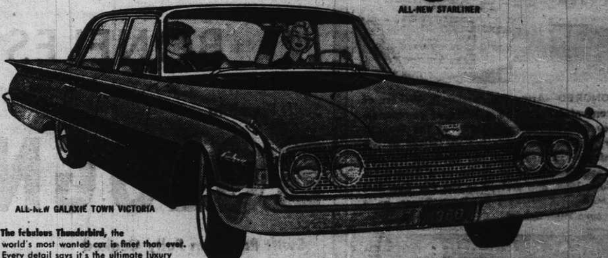
ALL-NEW GALAXIE TOWN VICTORIA

The fabulous Thunderbird, the world's most wanted car is finer than ever. Every detail says it's the ultimate luxury car. Performance is perfection.