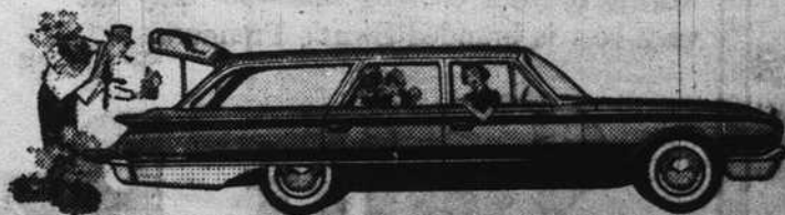
ALL-NEW 6-PASSENGER COUNTRY SEDAN

What a year to go Ford! Why not own the latest version of the world's most wanted wagon? Or perhaps you'd like the new, beautifully proportioned Galaxie below... an economy-minded Fairlane... or a big-value Fairlane 500. Maybe you'd like the brand-new Starliner at right or a sleek new Sunliner convertible.