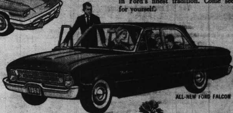
ALL-NEW FORD FALCON

Don't wait another second to see the car all America's been waiting for! The New-size Ford, the Falcon, lives up to your dreams of low price... ease of upkeep... and handling ease. And it's lovely to look at!