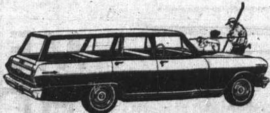
Chevy II 300 Three-Seat Station Wagon