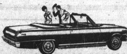
Chevy II Nova 400 Convertible