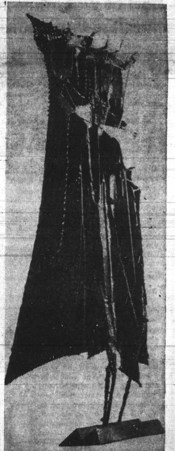
—See story on 'Trio,' Page 12—