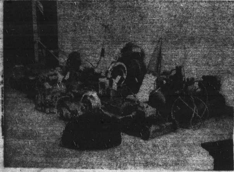
PART OF LOOT FROM THEFTS IN FOUR COUNTIES