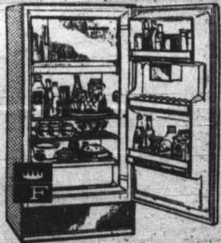
Model D-12-64 11.00 cu. ft., 4 colors or white

This is our "Best Buy" for National Frigidaire Week. Hurry!