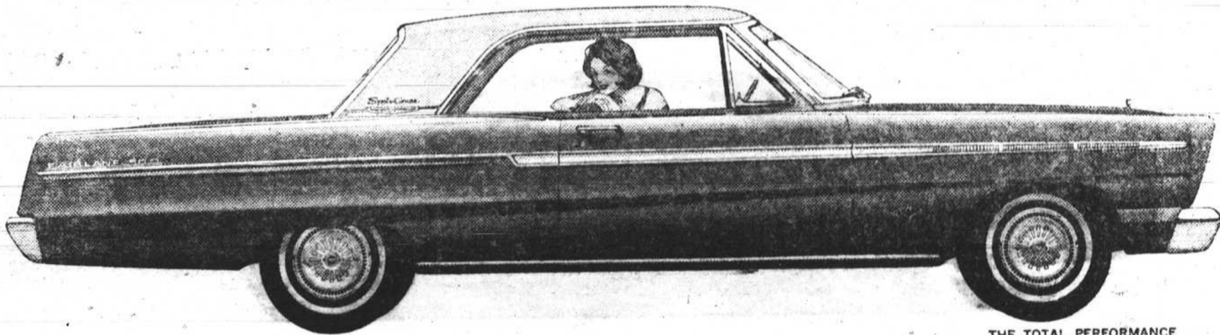
THE TOTAL PERFORMANCE FAIRLANE 500 SPORTS COUPE