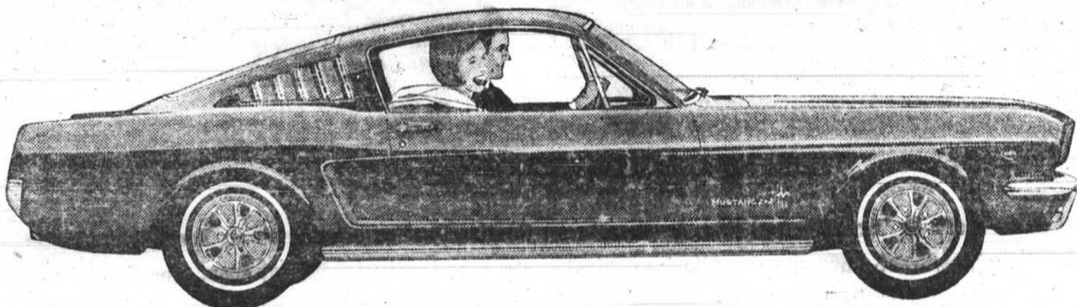
THE TOTAL PERFORMANCE MUSTANG 2+2