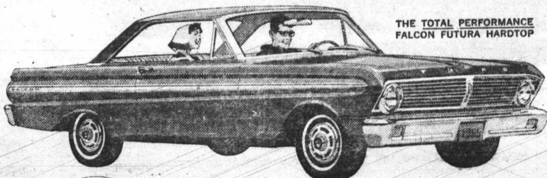
THE TOTAL PERFORMANCE FALCON FUTURA HARDTOP

New world of economy . . . 13 Falcons with up to 15% greater fuel economy as a new livelier Six teams with optional 3-speed Cruise-O-Matic. New battery-saving alternator.