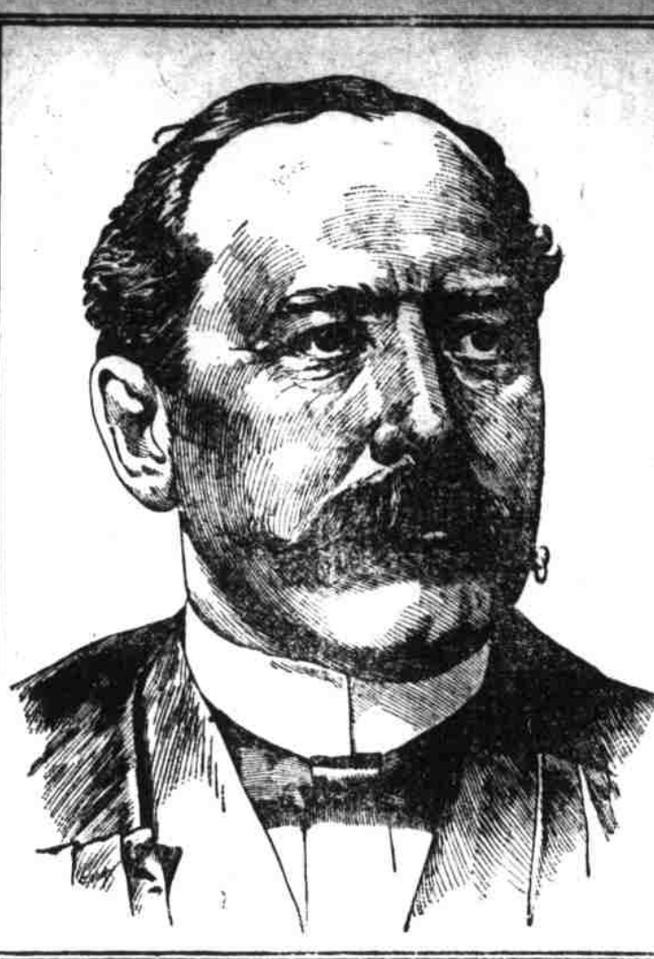
JUDGE ALTON B. PARKER.