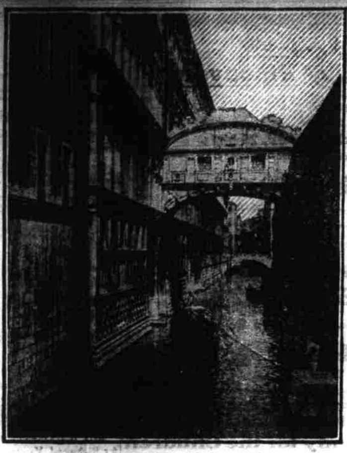
THE BRIDGE OF SIGHTS, VENICE. One of the sights of Venice is the Bridge of Sighs, which spans the Rio della Paglia and connects the ducal palace with the prisons. It is over 300 years old and has two passages through which prisoners were led for trial or judgment. A bridge of similar design and bearing the same name connects the Tombs prison with the criminal courts building in New York.

Hives are a terrible torment to the little folks, and to some older ones. Easily cured. Doan's Ointment never fails. Instant relief, permanent cure. At any drug store, 50 cents.