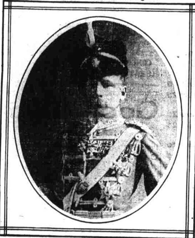
Ambassador Extraordinary and Plenipotentiary from Germany.