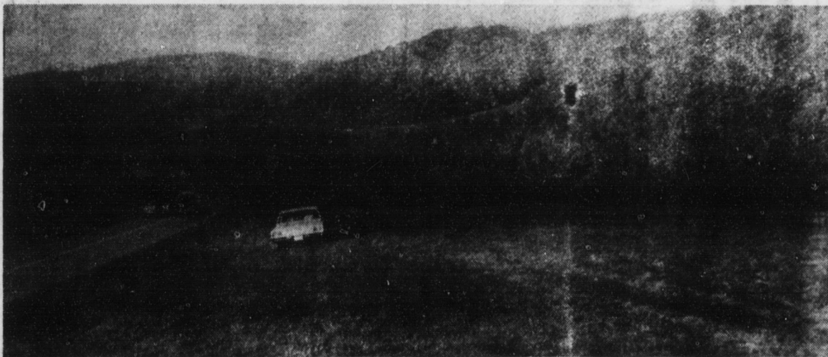
THERE ARE LEVEL SPOTS IN THE MOUNTAINS —This scene shows one, of many, beautifully grassed spots along the Blue Ridge Parkway. It seems that a long the highway when one notices that man has gone in to make the beauty of the mountains accessible that he has, at the same time, aided nature by beautifying the spots that were marred by pavement so that you and I could ride along in comfort and literally absorb the wonders of nature.