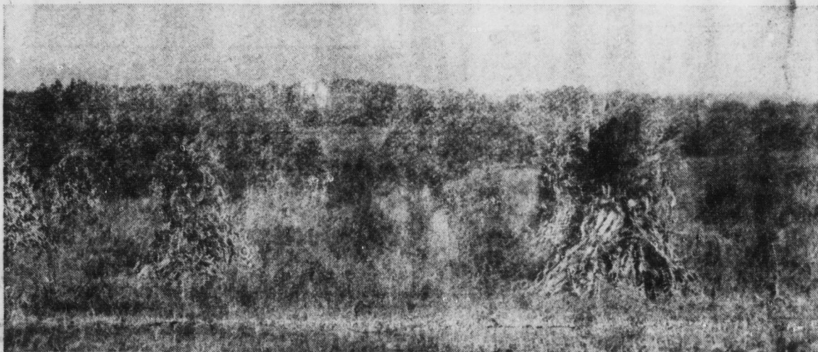
SHUCKS! THEY'RE STALKS —The corn has been gathered in the fertile fields of the mountains all along the Blue Ridge Parkway. The ears have been shucked and the remainder of the corn is just waiting to be shredded into feed to fatten some of the finest cattle in the country, along with the plain old milk cow. This scene taken in Doughton Park, on the Parkway, makes you realize that Halloween is nearly here.