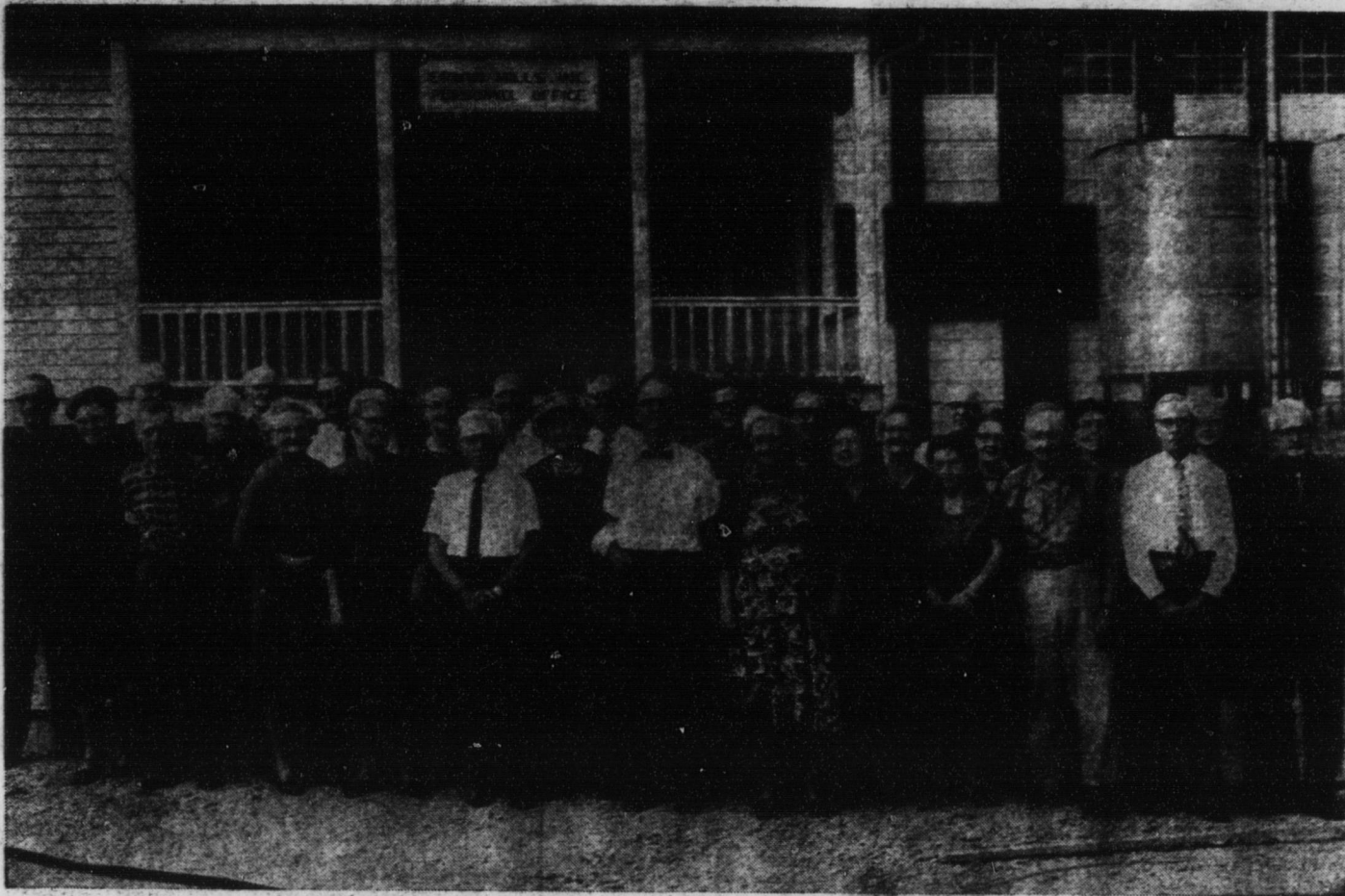
THIS PICTURE WAS MADE WHEN CLUB WAS FIRST ORGANIZED.

COOLEEMEE, N. C. THURSDAY, JANUARY 27, 1966