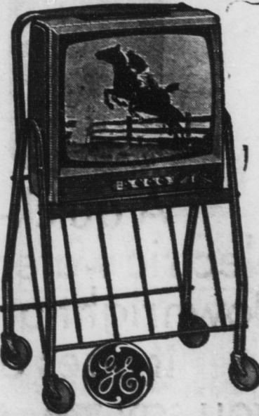
ADVENTURER III Model M430CBG