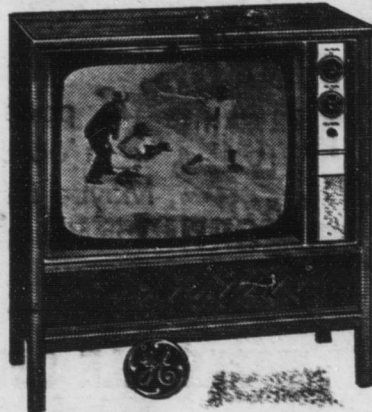
THE ALLENWOOD Model M960BWD