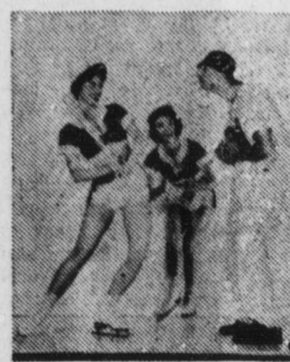
WEDNESDAY NIGHT JUNE 22ND

On Wednesday night June 22nd Max Patkin, Baseball's funniest clown will appear at Beautiful Ernie Shore Field as a special attraction when the Winston-Salem "Red Sox" play Kinston "Eagles" at 7:30 P. M.