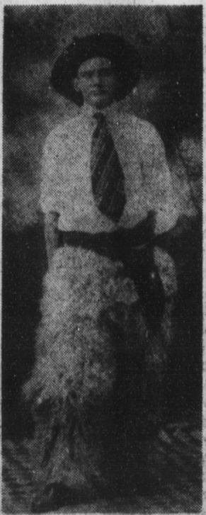
WHO IS THIS YOUNG MAN?