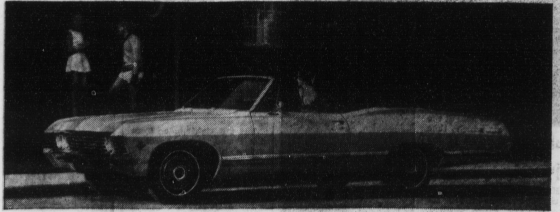
Impala Convertible—with most everything higher priced cars give you

(And that low price brings you a road-sure ride, Body by Fisher quality, and a traditionally higher resale value. You also get wider front and rear tread for greater stability and handling, foam-cushioned seats, and extra fenders inside the regular ones to help inhibit rust. Most everything more expensive cars give you!)