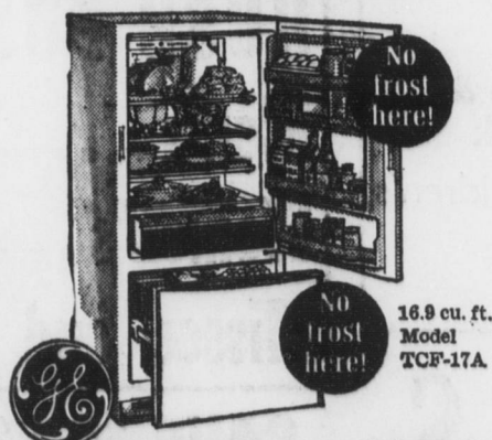
'Spacemaker 17' with Automatic Ice-maker

Ice A-plenty! General Electric replaces ice automatically!