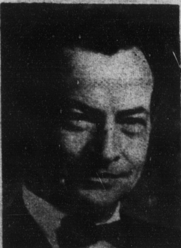
ELDON NIELSON Republican Congress, 5th District