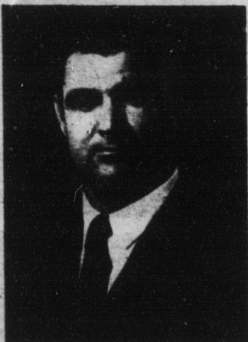
WILMER MIZELL Republican Congress, 5th District