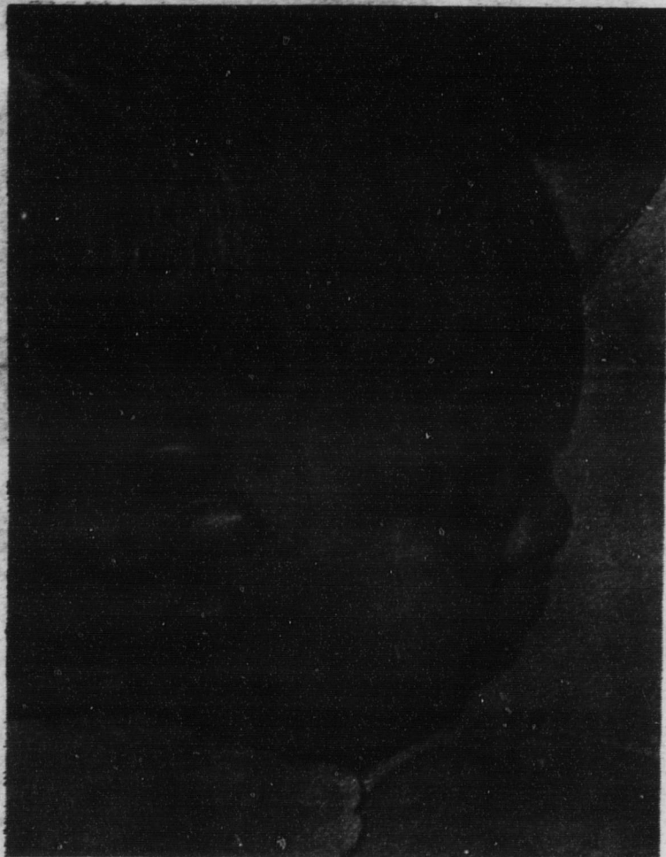
... But this little fellow couldn't care less who won.