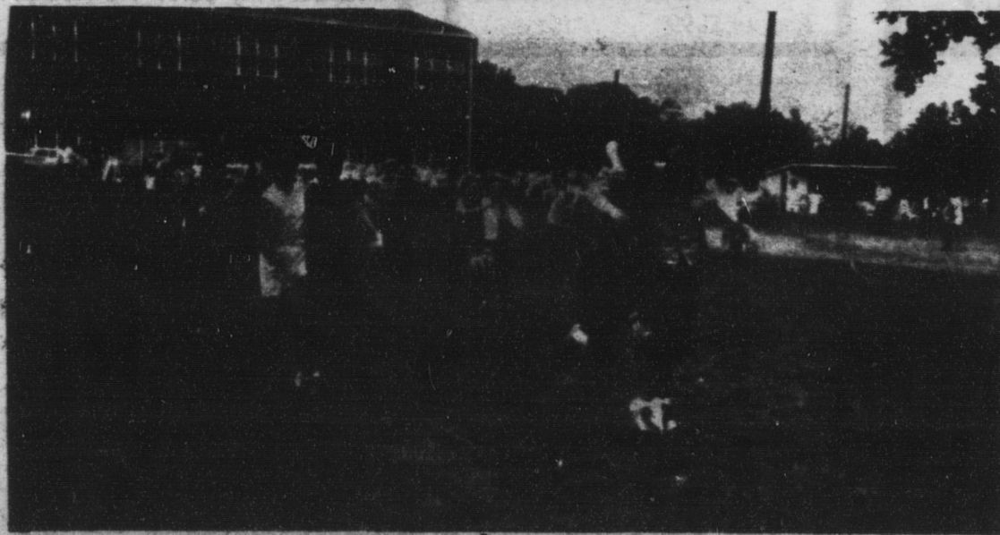
Boys lead the girls in a three le