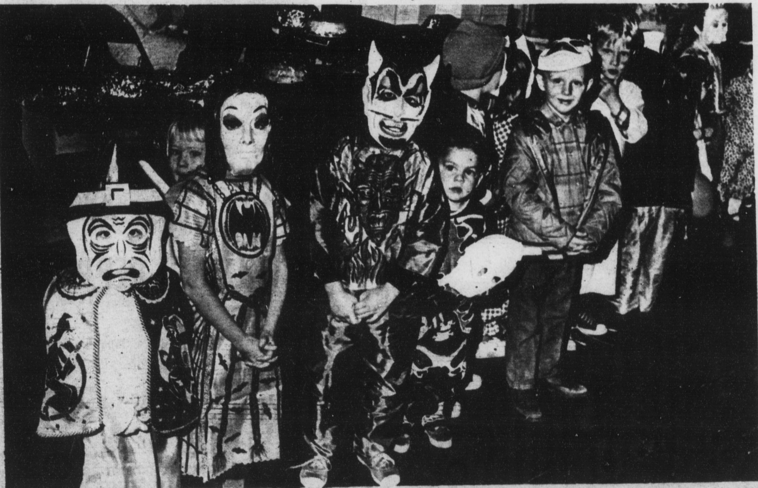
Youngsters enjoy the Halloween Carnival.