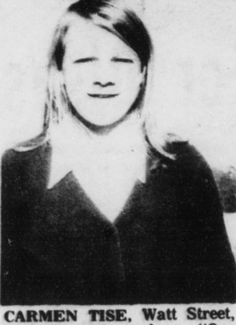
time in the 4th grade, a girl gave me some woman's beads."