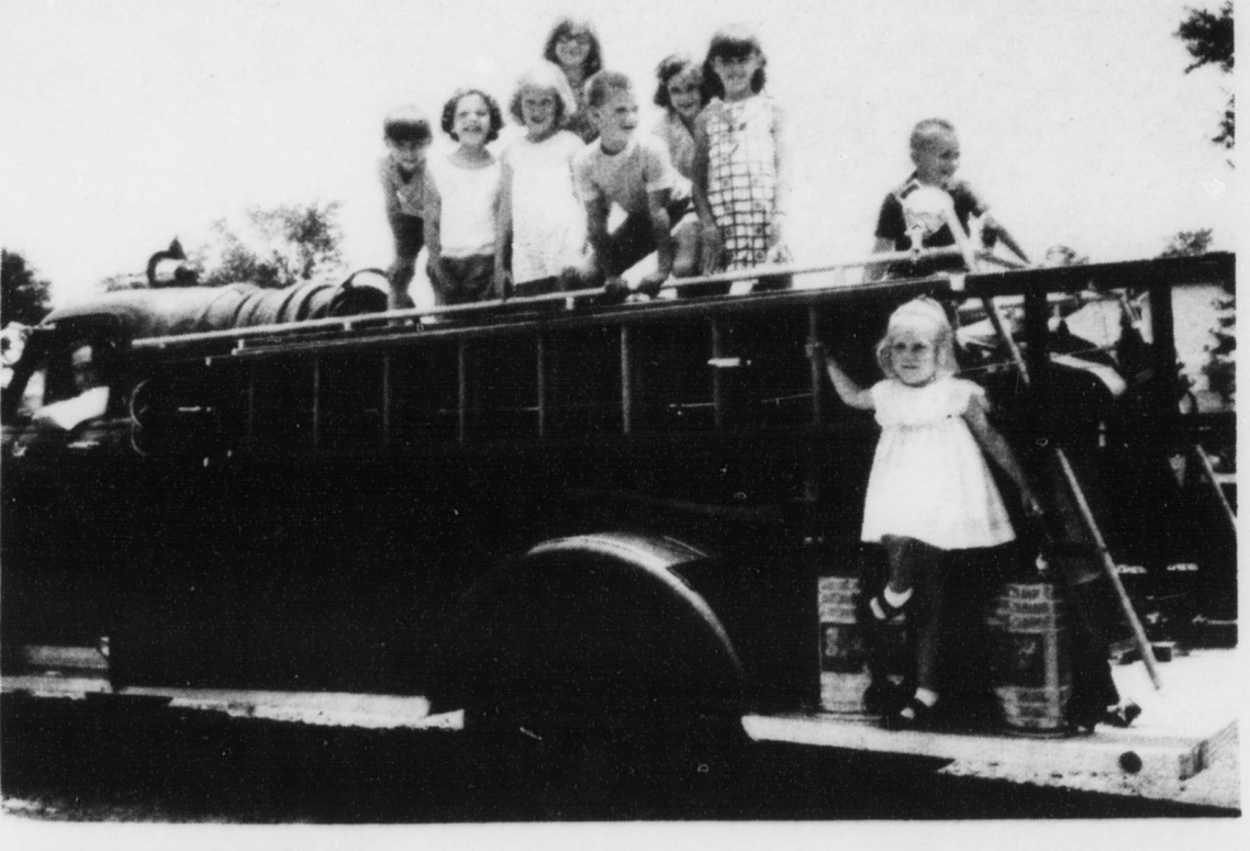
The fire engine from the Jerusalem Volunteer Fire Department led the Vacation Bible