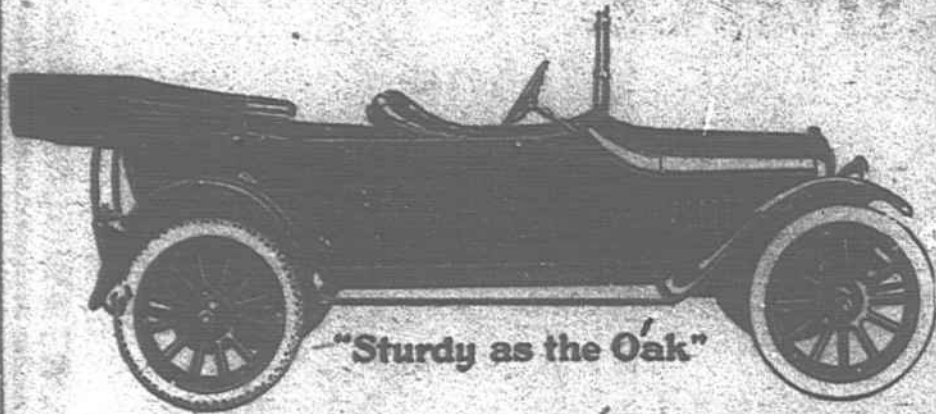
"Sturdy as the Oak"

Body - Five passenger touring car, two passenger roadster Motor - Oakland-Northway, six-cylinder. Frame - Pressed steel. Front Axle - I-beam, drop forged. Rear Axle - Full floating, one bearing. Springs - Front, Semi-elliptic; Rear, Three-quarters elliptic, underslung. Cooling - Circulating, centrifugal pump and fan. Oiling - Circulating splash system, sight feed on dash. Carburetor - Marvel. Clutch - Cone type, ball bearing release shoe. Transmission - Sliding gear, selective type. Starting, Lighting and Ignition - Remy. Storage Battery - Willard Drive - Hotchkiss. Brakes - Service, external contracting; emergency, internal expanding. Steering gear - Irreversible type, 17-inch steering wheel. Control - Center, ball type, left-hand drive. Wheels - Artillery type, demountable rim. Tires - 32x3 1/2, non-skid on rear. Wheelbase - 110 inches. Gasoline System - Oakland Stewart Vacuum System, gasoline tank in rear. Tank Capacity - Gasoline, 12 gallons; Oil, 1 gallon. Trimming - Genuine machine buffed leather. Equipment - One man top, Stewart speedometer, gasoline gauge, robe rail, foot rail, extra demountable, rim, clear vision divided windshield, electric headlights with dimmers, tail light and instrument board light, license tag brackets, electric horn, rubber floor mat in driving compartments, tools, etc.