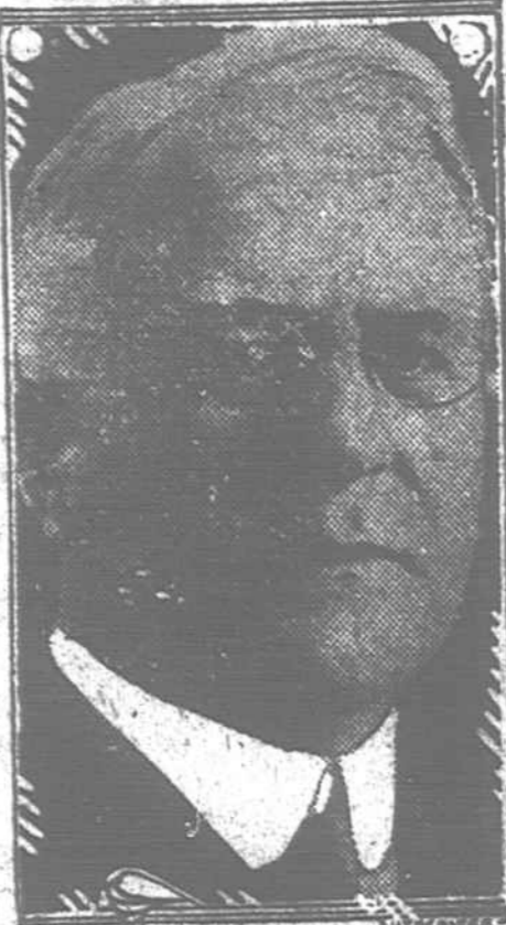
James Couzens, millionaire mayor of Detroit and former partner of Henry Ford, is the new U. S. Senator from Michigan, appointed to the Truman H. Newberry seat, the office to which Ford aspired against Newberry in the now famous election scandals, which finally resulted in Newberry's resignation this month.