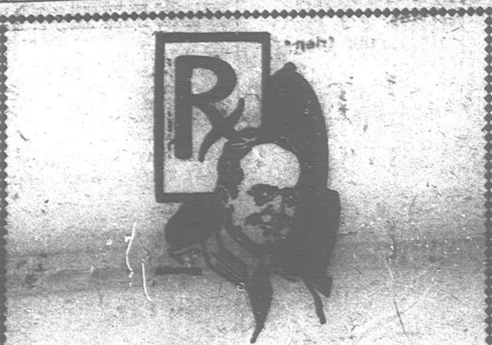
A POSITION OF TRUST

Both the banker and the druggist hold positions of trust in every community. The prescription in the hands of a druggist should be as inviolable as a check or other valuable papers in the hands of a banker. When you bring your prescriptions to this store you always get what the doctor ordered.