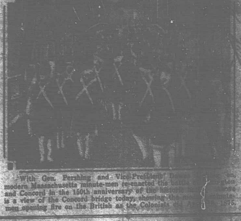
With Gen. Pershing and Vice-President Dawkins on the Lexington battlefield, the modern Massachusetts minute-men re-enacted the battle of Concord in the 150th anniversary of the battle.