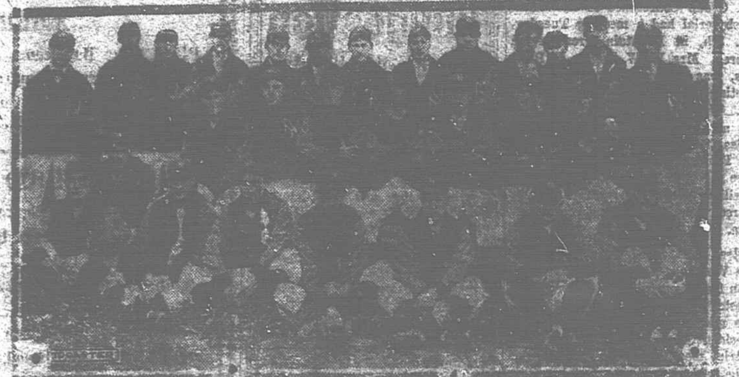
Group picture of the New York Yankees...