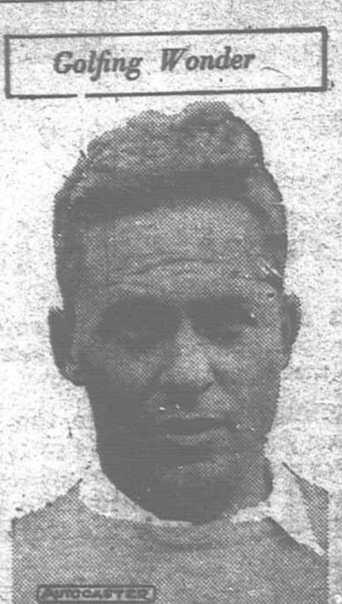
Golfing Wonder Bobby Jones, Atlanta, Ga., today is the acknowledged golfing wonder of the age. His 285 for 72 holes, 6 better than ever scored in British open title play, won the crown and highest honors.

Raleigh, N. C., July 27.—The $75,000 State Fair bond issue was voted yesterday by Raleigh people by a large majority.