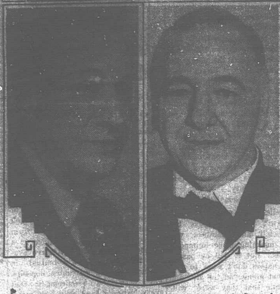
The first two nominations for Ambassadorships sent to the Senate by President Roosevelt were those naming James I. Strauss of New York, Ambassador to Paris, and right, Hon. Josephus Daniels, of Raleigh, N. C., Secretary of Navy under Woodrow Wilson, Ambassador to Mexico City.