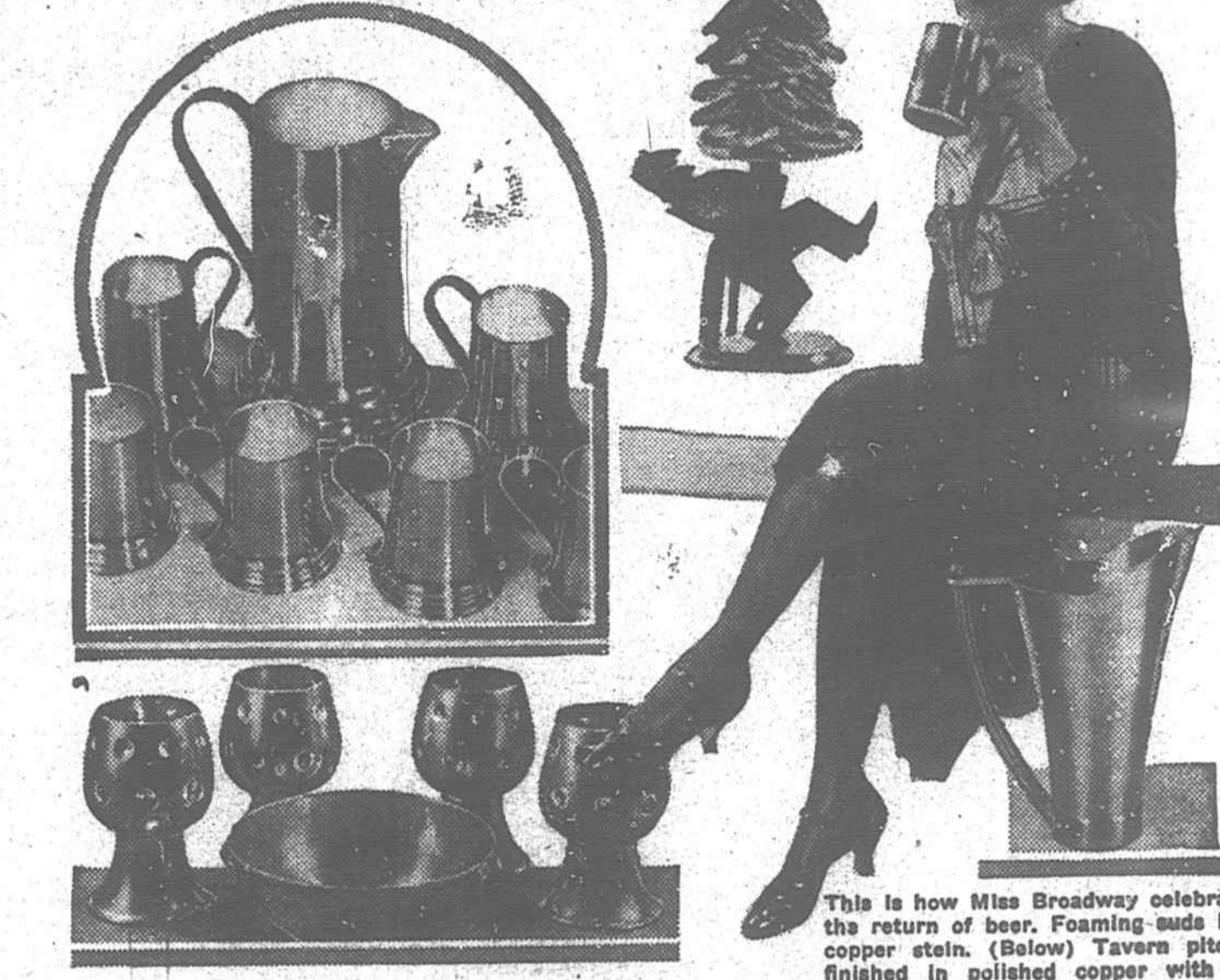
(Top Center) Copper pretzel man holding aloft a tray and stick. (Below) This old Heidelberg copper beer stein brings back the tavern atmosphere. (Bottom) Bacchus goblets with thumb-print design and a bowl for pretzels.

For he's a jolly good fellow, For he's a jolly good fellow, For he's a jolly good fellow, Which no one can deny.