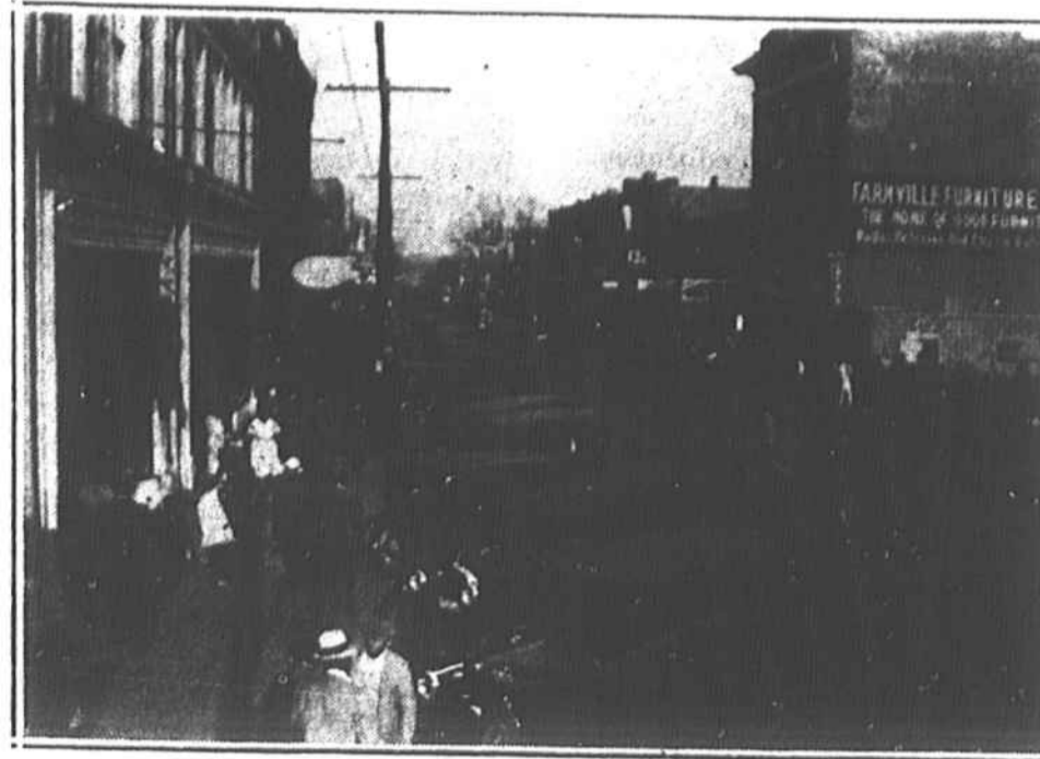
MAIN STREET, FARMVILLE, ON A SATURDAY AFTERNOON

The officers reelected to serve another term before adjournment for the summer months were: Miss An-