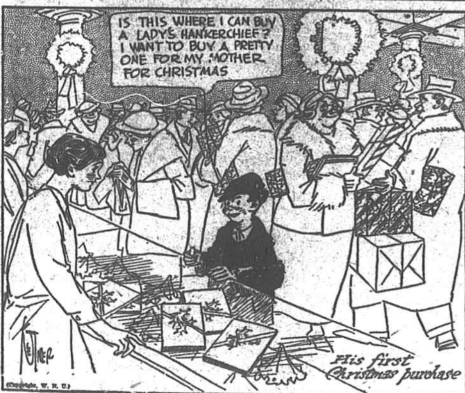
His first Christmas purchase