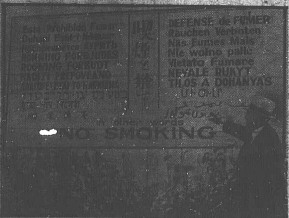
This sign in 22 languages stands at the entrance of the Long Bell Lumber company plant at Longview, Wash. All 22 lines say the same warning to workers, executives and visitors. Spanish, Filipino, Russian, Greek, Hebrew, French, German, Portuguese, Polish, Norwegian, Swedish, Italian, Dutch, Arabic, Japanese, and six other foreign tongues and at the bottom "NO SMOKING" in English.