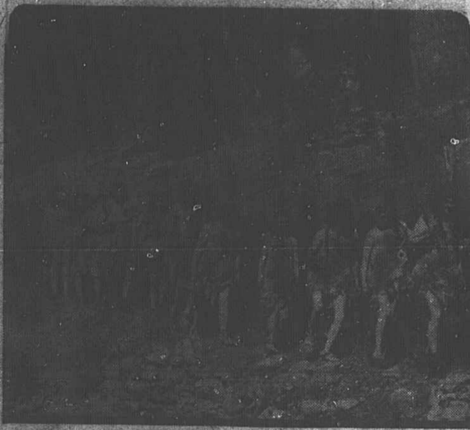
These members of the Cavemen and Cavewomen, the only organization of its kind in the world, are on the way to the Oregon caves where they hold their meetings. They are always ready to greet eastern tourists and initiate them with weird ritual.