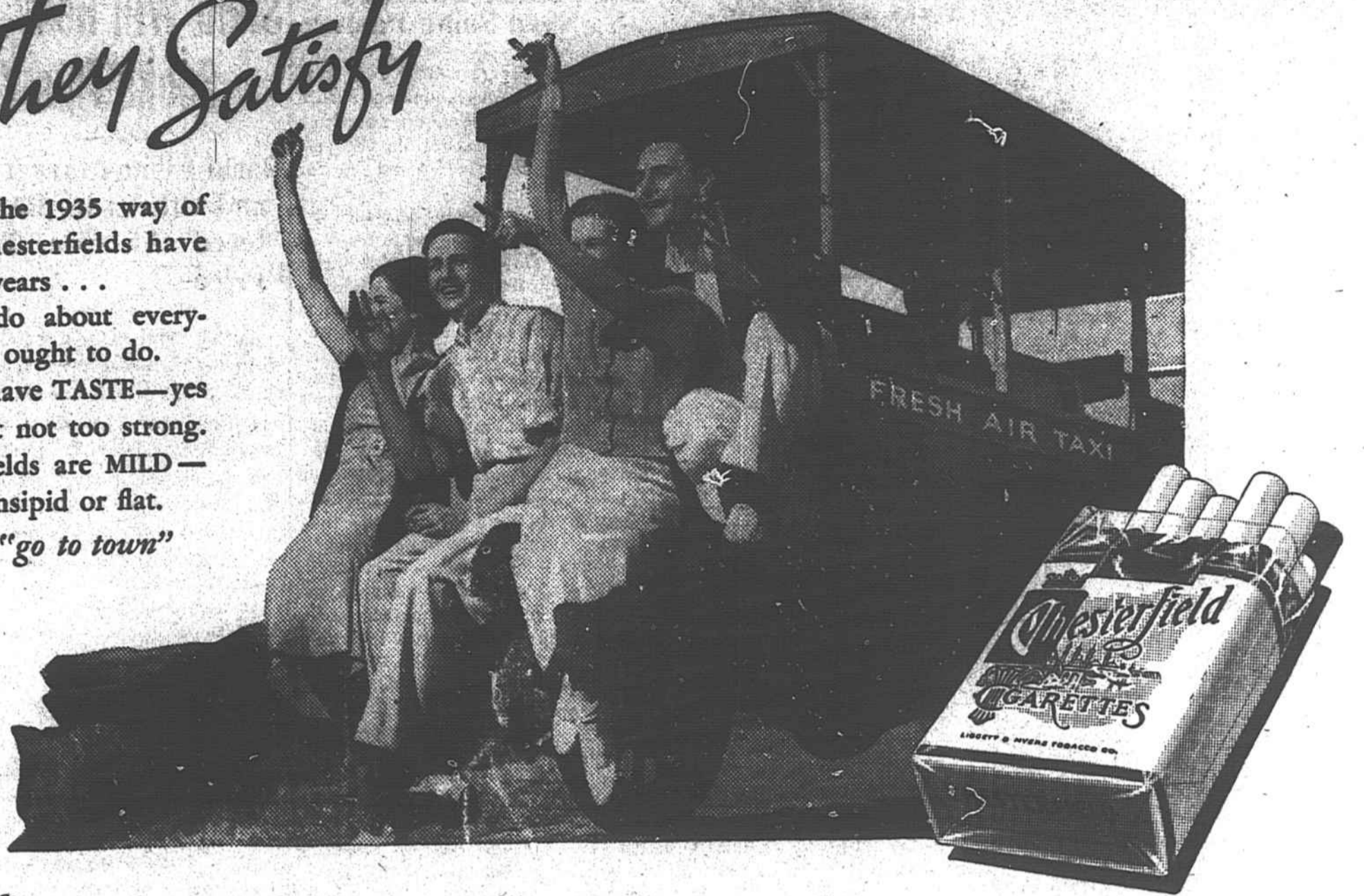
© 1935, LIGGETT & MYERS TOBACCO CO.

—that's just the 1935 way of saying what Chesterfields have been saying for years . . . Chesterfields do about everything a cigarette ought to do. Chesterfields have TASTE—yes plenty of it. But not too strong. And Chesterfields are MILD—but they're not insipid or flat. Chesterfields "go to town"