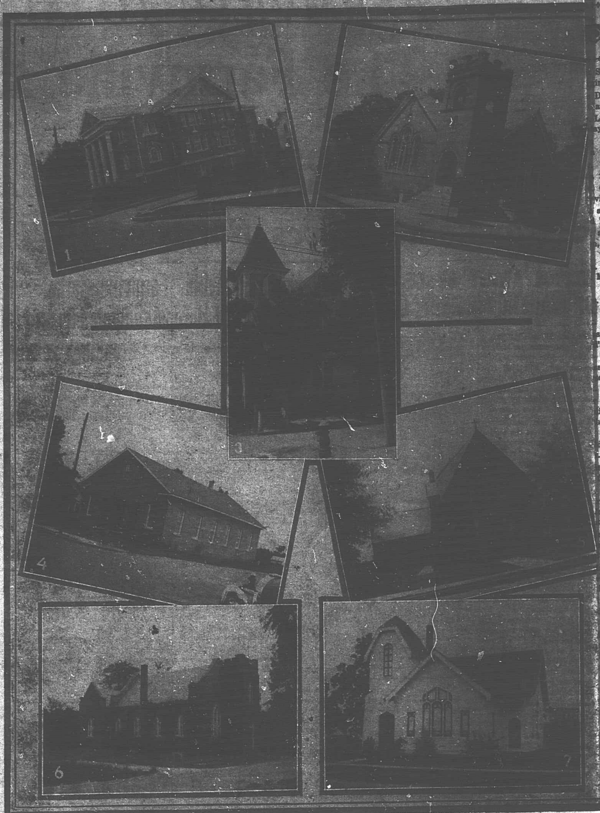
1—Methodist Episcopal Church, corner Church and Walnut Sts. 2—Christian Disciples Church, corner Main and Church Sts. 3—First Baptist Church, corner of Wilson and Green Streets. 4—Primitive Baptist Church, corner of Wilson and May Streets. 5—St. Elizabeth Catholic Church, corner Contentnea and Walnut Sts. 6—Emanuel Episcopal Church, Walnut St., North of Church. 7—First Presbyterian Church, corner of Walnut and Pine Sts.