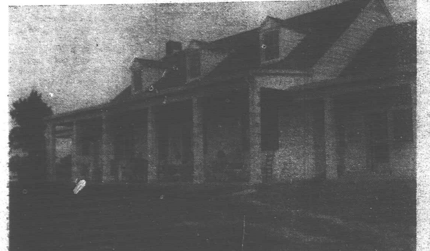
GRANDSTAND GOLFERS ENJOY SPACIOUS VERANDA OF NEW COUNTRY CLUB BUILDING

Feeling the need of more adequate quarters a campaign was put on some months ago and $4,000 was subscribed by members and other Farmville citizens to enable the Club to obtain a WPA grant of $9,000 for the construction of the new club house, work on which has progressed rapidly through the summer. $4,000 has also been spent in golf course improvements.