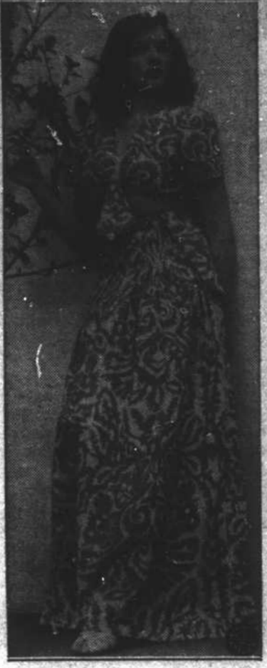
Handblock cotton in shades of dull rose is used to make this beach frock worn by Gene Tierney, lovely film star. The skirt ties on, and underneath are matching shorts to form a play suit when the skirt is removed.