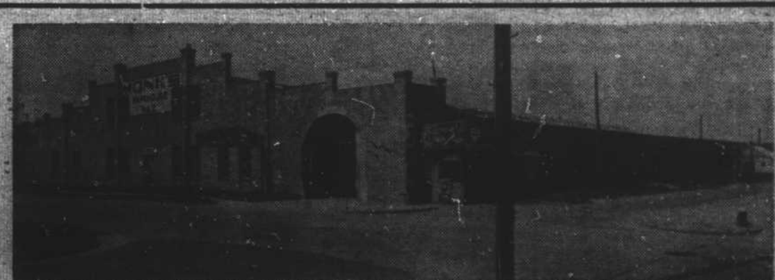
— MONK'S WAREHOUSE No. 2 —