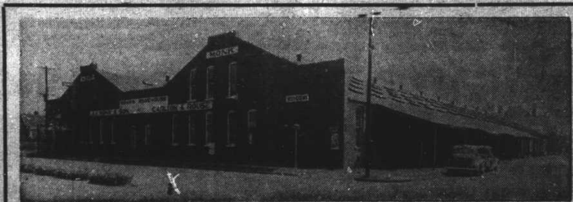
— MONK'S WAREHOUSE No. 1 —