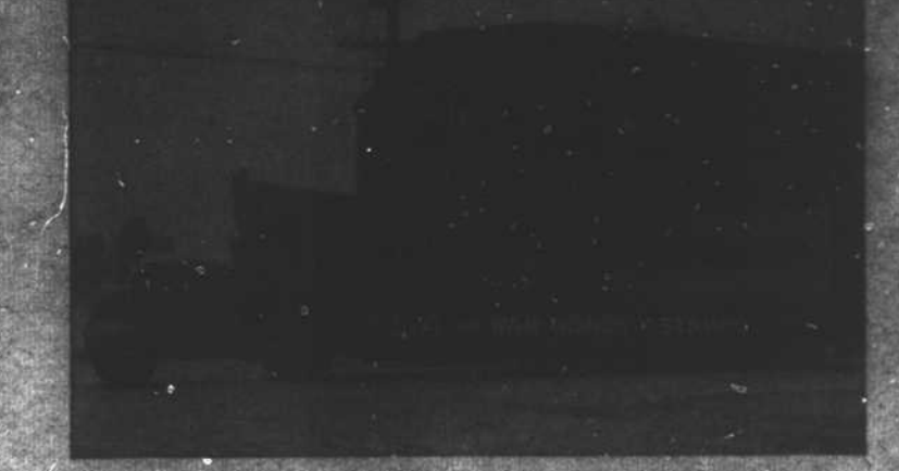
This big Frushoff trailer used to carry new automobiles to dealers, today it transports life-boats to Southern shipyards. The trailer shown above carries four life-boats each 24 ft. long and fully loaded, ready to go.