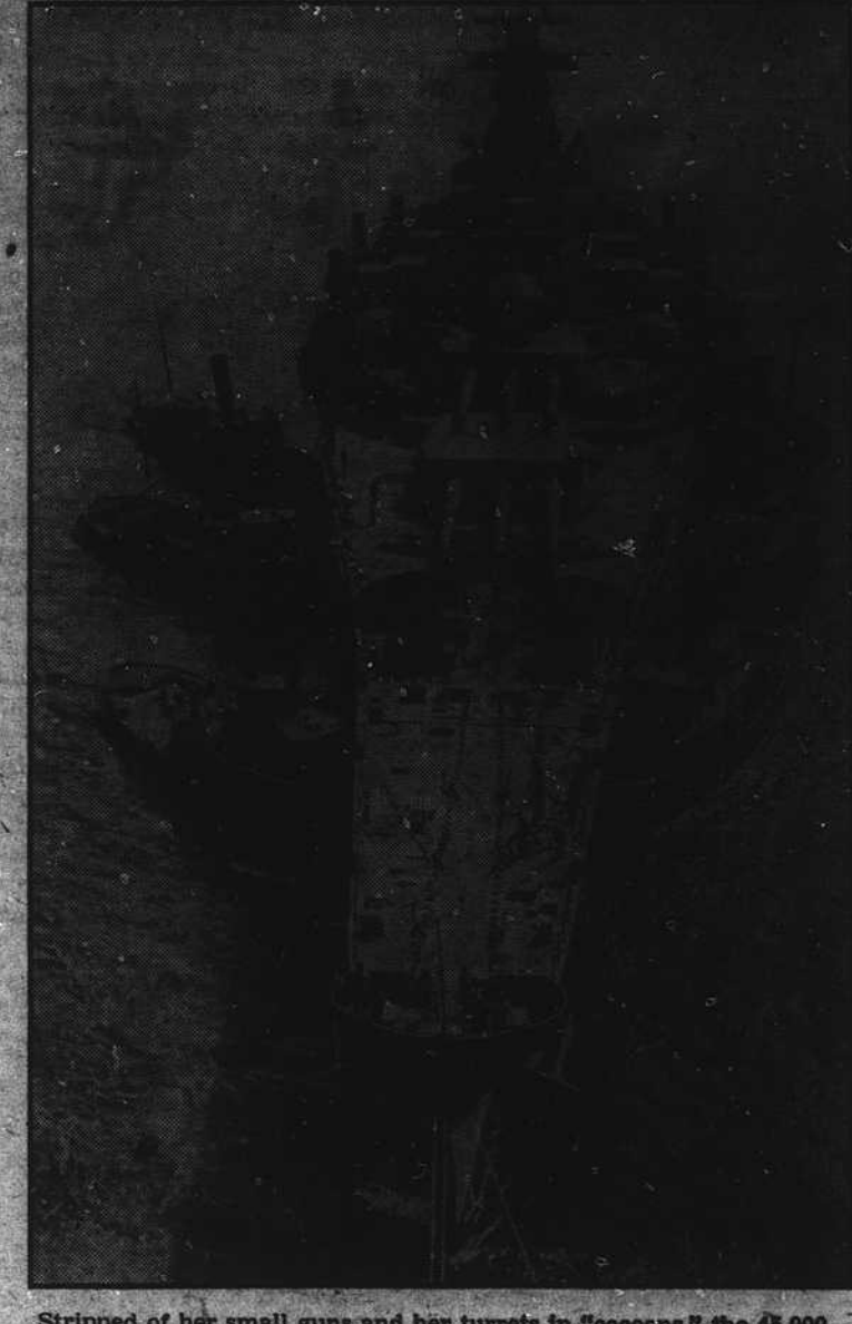
ton battleship New Jersey is tugged through New York harbor on her way to the Bayonne, N. J., Naval Annex for decommission. A veteran of Pacific fighting, she will join the Navy's mothball flee: and be held in reserve.