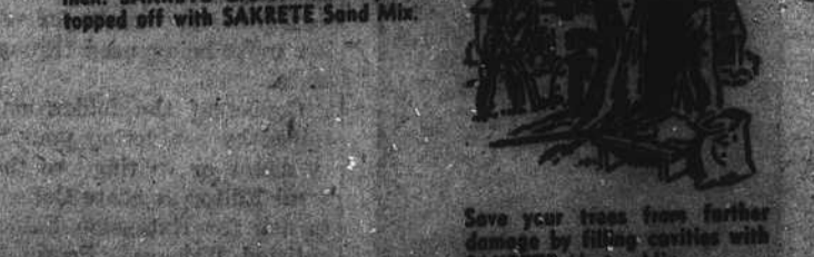
Save your time here further damage by filling voids with SAKRETE Mortar Mix.