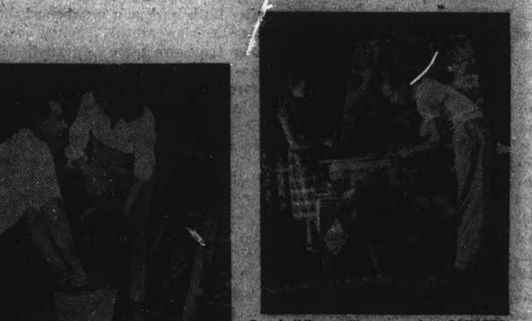
For building grills, remember SAKRETE Mortar Mix is ideal and easy to use, whether you build it of stone or brick.