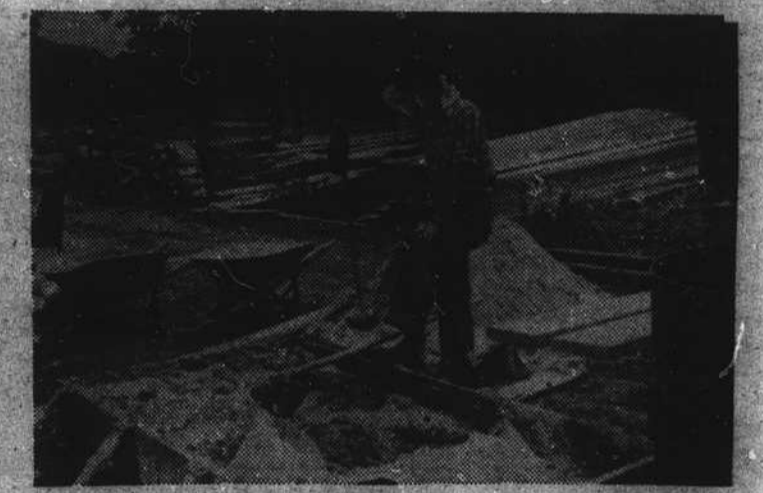
Here's what always happens when you try to mix cement or concrete by hand and by guess. Next time buy SAKRETE . . . just add water and use.