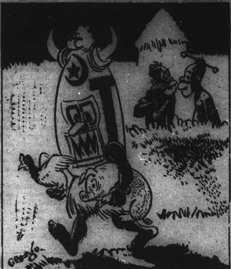
"Doc has an awful time. First he has to frighten his patients into getting well. Then he has to frighten 'em into paying their bills!"