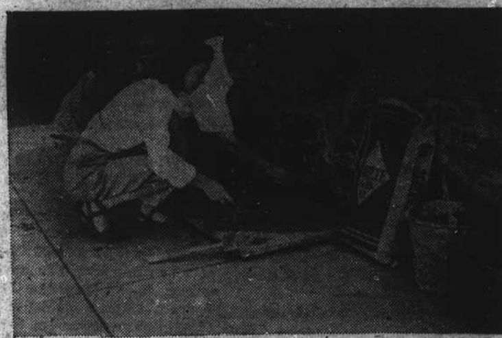
See how easy it is to patch a wall with SAKRETE Mortar Mix. Walls should be repaired before small cracks become big breaks.

There are three types of ready-mixed SAKRETE, packed in convenient moisture-proof sacks, prepared in scientifically uniform proportions for building or patching a wide variety of concrete and masonry items.