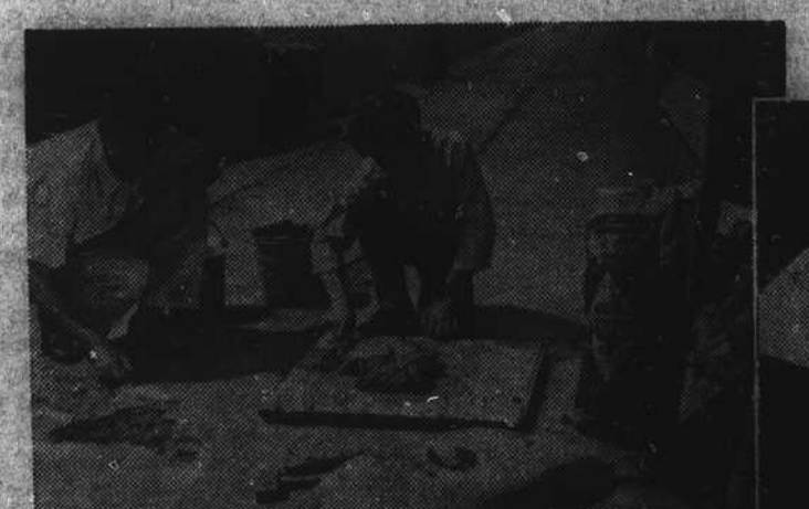
According to municipal records, the hazard of broken sidewalks is the basis for the greatest number of damage suits. For strong repairs to walks, pavements, walls, floors, etc. . . use SAKRETE Gravel Mix. It can withstand 4000 pounds per square inch. SAKRETE Gravel Mix may be topped off with SAKRETE Sand Mix.