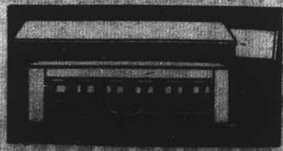
"The World's Best Tobacco Curer"

We congratulate Florence-Mayo on the completion of their new curer factory!